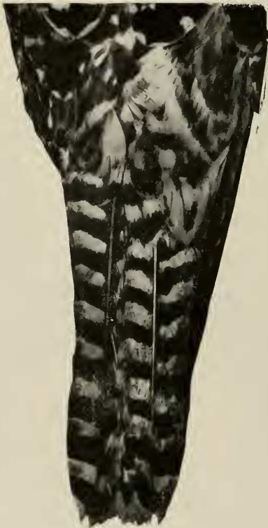
Falco rusticolus , Gray Gyr Falcon, female. (No. 607 collection of W. F. H., October 29, 1905, New Herruhut, Greenland.)